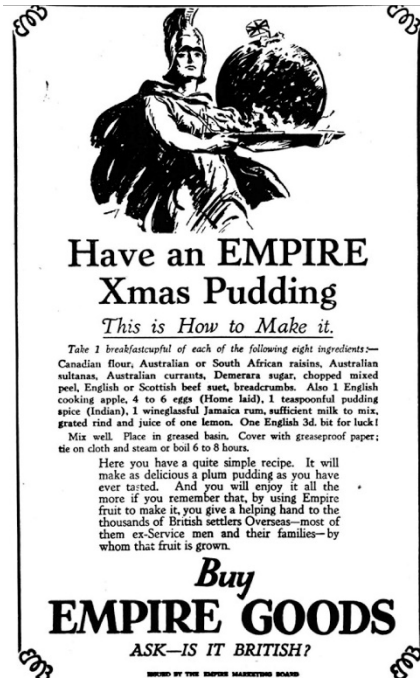
Figure 6 – Empire Marketing Board, “Have an EMPIRE Xmas Pudding,” 1926

Netherlands had their own colonies in the Caribbean, Africa, and Asia and were able to supply rum, spices, and dried fruits to British buyers for the recipe. This market competition could potentially deprive the British Empire of available capital from its own citizens if English