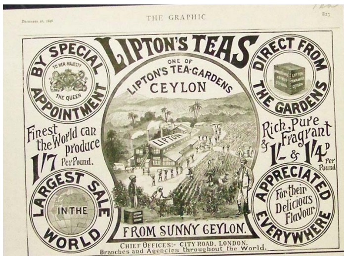
Figure 2 – Lipton Teas, 1894

One nineteenth-century tea brand that is still prominently known is Lipton Tea. In 1871, Thomas Lipton began his business in Glasgow and by 1889 had imported 20,000 tea chests. In 1890, Lipton purchased 5,500 acres for tea gardens in Ceylon and began importing and selling his own tea within both the British and American markets (“3 Ways”). Lipton Tea was unique in