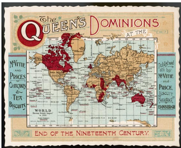
Figure 4 – McVitie’s and Prices, The Queen’s Dominions

tactic. 33 The advertising strategies essentially seek to capitalize on and also transform buyers’ cultural understandings and identity with particular commodities. Convincing buyers that consuming certain goods will enhance their social status, improve their circumstances, or allow them to connect more deeply with their community transforms their perceived national identity. In the case of the Empire Marketing Board, its advertisements endeavored to construct a national identity and community by telling English consumers that their duty as citizens was to buy imperial commodities in order to support the national economy. Advertising’s ability to mold a nation’s culture forms a “projection, not a reflection, of the economy” and the culture in which the customer exists (Kothari 46). It isn’t the purchaser who creates culture but the advertisers who strive to sell their items by capitalizing on the needs and experiences of their clients. Ultimately, these representations influence a viewers’ outlook on culture and their relationship