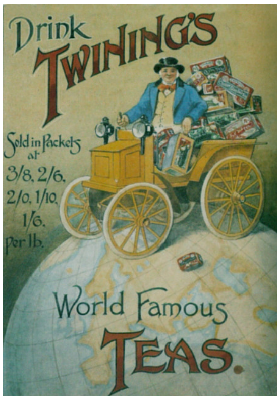
Figure 3 – Twining's Tea Advertisement

Twining's is arguably the most famous British tea brand in the world and the one many associate with English tea drinking habits. Founded in 1706, Twining's is the oldest tea company operating in England and still maintains its original store in London on 216 Strand. The company has also been a Royal Warrant Holder since 1837. The designation grants the company the privilege of supplying goods to the royal family. Twining's has held this honor since the reign of Queen Victoria, establishing the company's title as a "British" tea brand ("History of Twining's"). When Twining's received its Royal Warrant, it would have supplied tea for a