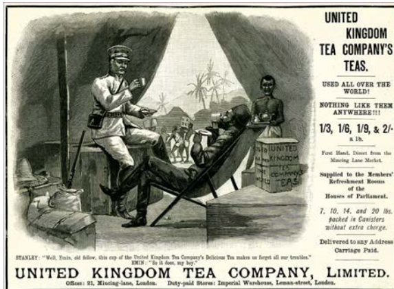
Figure 1 – United Kingdom Tea Company, 1890

period. However, their advertisements still remain and one seemingly popular brand was the United Kingdom Tea Company. There is nearly no significant historical information available on this company, though they seem to have published advertisements throughout the latter part of the nineteenth century. The company appears to have established a marketing campaign that exemplified the ideal of Great Britain as a sovereign and superior power over its colonies within