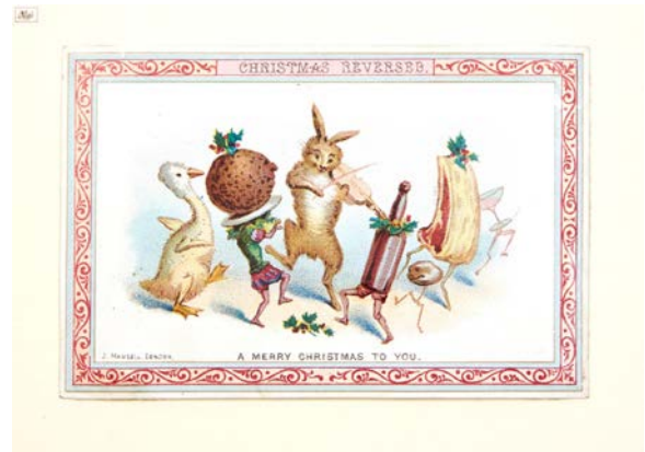
Figure 5 - Victorian Christmas Card, 1843

As with Christmas pudding, if buyers believed the dessert was an integral part of the holiday celebration, it would satisfy both their need to participate in the national community and need to be familiar with social mores. For Victorians, their “society had perceived national or dominant values” and the “noble standards