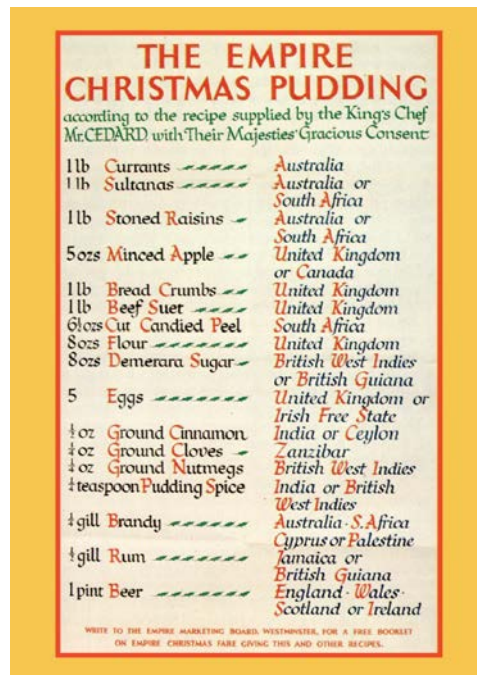
Figure 7 – Empire Marketing Board, “The Empire Christmas Pudding,” 1926

Palestine; and rum from Jamaica or British Guiana (“Empire Christmas Pudding”). The wide breadth of locations from which these goods derive demonstrates the vast size of the British Empire and its ability to supply these foods to its citizens. There is ultimately no need for them to purchase these commodities from foreign merchants, such as France or the Netherlands. Listing the colonies from where these ingredients were grown and cultivated not only informs Britons as to the location source of these items within the Empire, it also ensures they’re “buying Empire” when they shop.