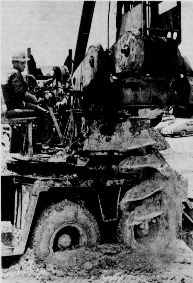
CONSTRUCTION rolls smoothly in Worth Hills despite the mounds of earth to be drilled or shoveled away.