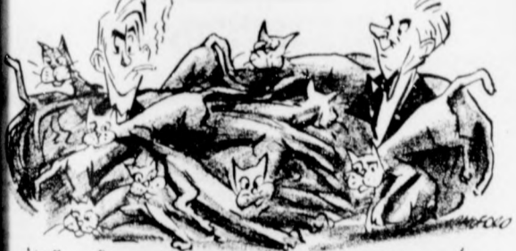
It took two or three Philip Morris to restore my native sweetness

But I digress. We were talking about roommate etiquette. Let us turn now to the matter of share and share alike. Have you shared everything equally? Drawer space? Closet space? Study space? And here's one that often causes trouble - hobby space.