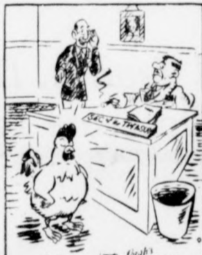
SHE WANTS A JOB. CLAIMS SHE LAYS GOLDEN EGGS!!