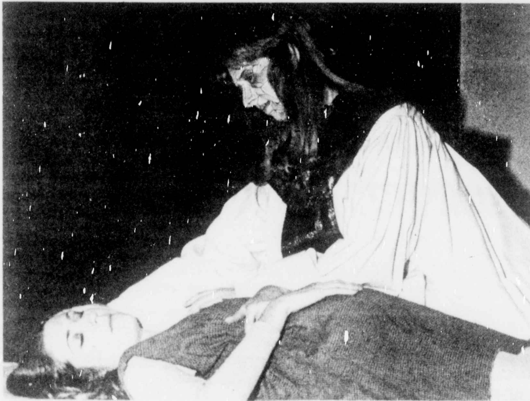
Eve prepares to deliver a baby as a widwife helps in a scene from "The Creation of the World and Other Business," a play by Arthur Miller. The play will be presented in the University Theatre May 6 through 8 at 8:15 p.m.