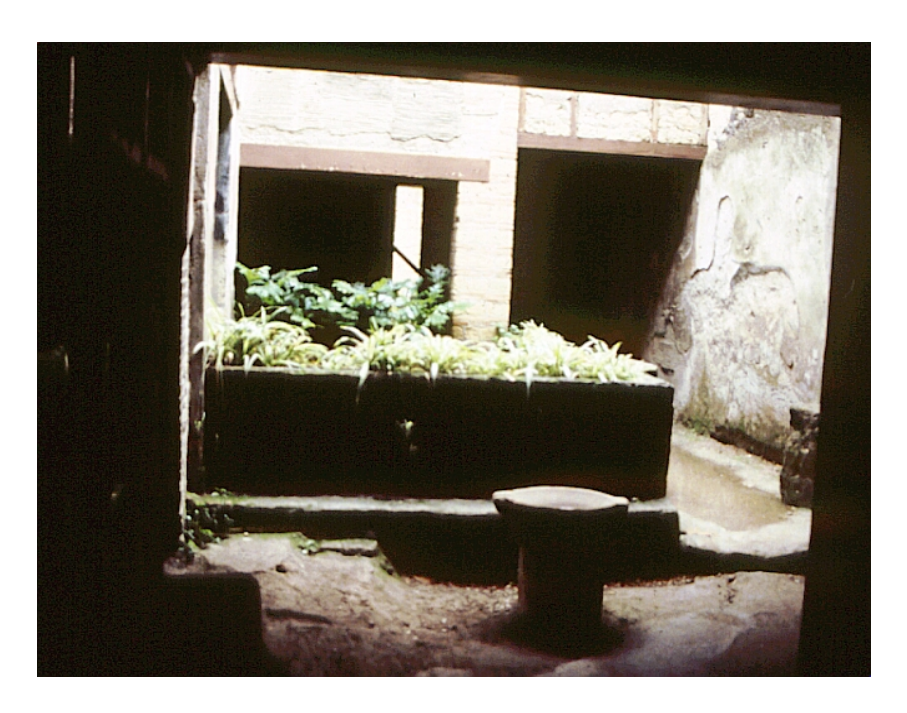
Fig 2 Courtyard and only common space of a crowded multi-resident, multi-storied apartment building, known as the Casa a Graticcio in Herculaneum, first century CE so called because of its use of a common low-standard method of construction using cemented rubble in wood frames. Such apartment houses were notorious for danger of fire and collapse.

people cooked for themselves at all, it would have to have been on some makeshift portable apparatus in a nearby outside space. More likely, they bought fresh bread, fruit, and vegetables at local markets and got most of their cooked food from neighborhood vendors and thermopolia – the equivalent of fast food restaurants. They ate meat rarely if at all, typically only when present at feasts given by wealthy city patrons. If they bathed, it was in the public baths, apparently open to both men and women. They used public latrines.