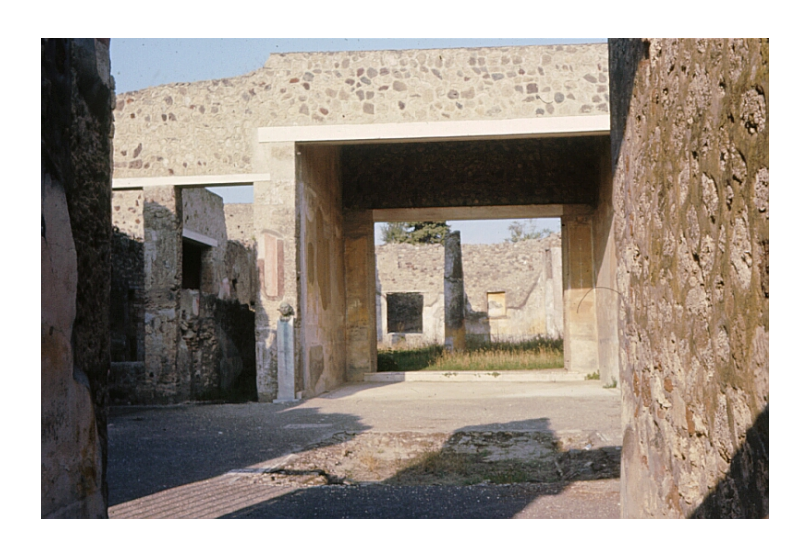
Fig 4 House of Lucius Caecilius Jucundus, son of a freedman, at Pompeii, first century CE. This simple domus illustrates the relative wealth possible for a freedman and his immediate descendants. The owner was involved in a number of business ventures, as witnessed by the records he left behind.

Whether for upper or lower classes, standards of sanitation and safety left much to be desired. Disease was rampant and life expectancy low. With no knowledge of how diseases spread, inhabitants were defenceless against it, especially in the large cities. Most methods of prevention and healing were folk remedies or magical incantations with very mixed success. Garments made of wool, the standard material for most clothing, were bleached with urine, both human and animal, before being treated with other chemicals, including sulphur, and washed. Most hygiene arrangements were primitive. Apartment buildings and larger houses had their own common latrines, but no centralized plumbing for waste removal. Public latrines were accessible to all, seemingly for both sexes. Defecation and urination were not considered private functions.