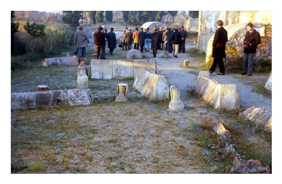
Fig 6 Inhumation and incineration burials of the poor, first - third centuries CE at Isola Sacra, the cemetery of Portus, port of Rome. While wealthier people chose family mausolea (visible in background), these represent those of more modest means, who could yet afford a decent burial rather than deposition in the common pits with the poorest people. Photo taken in 1973: these burial are no longer in place.