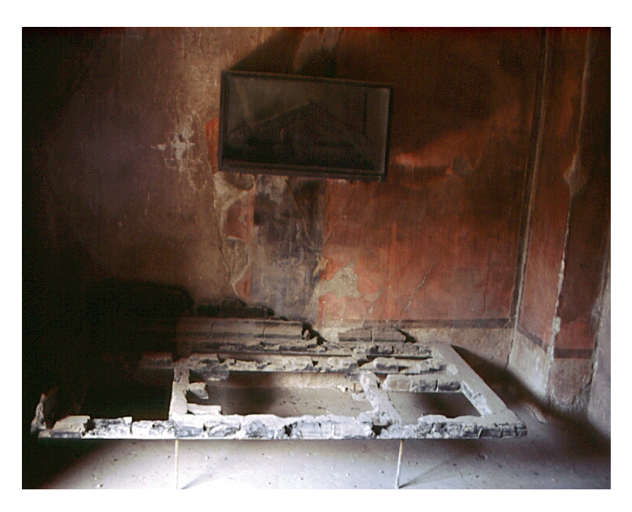
Fig 3 Single-room apartment with remains of wooden bedstead on the second floor of the same apartment building (Fig 2 above) in Herculaneum, first century CE. Remnants of a painting adorn the back wall. A whole family may have lived in such a room, cooking on a brazier outside.