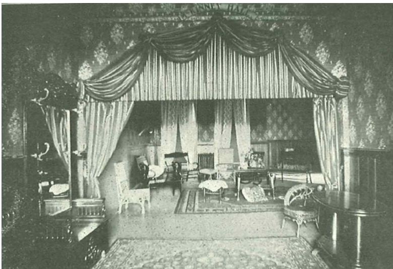
Figure 10. Girls’ Home Reception Hall. 1903 Pictorial Bulletin.

The buildings on campus were also a drawing factor. The main building was large, well-built, and comfortable, but the new girls’ dormitory was the most impressive facility. It was up to date, equipped with a furnace for heat and electric lights, and photographs of the interior of the Girls’ Home from a university bulletin support the brochure’s description of the building as “a model of elegance, comfort and neatness.” 14 Pictures of the reception hall and parlor show ornately patterned carpets, rugs, and wallpaper as well as matching curtains on the many windows (see figures 9 and 10). The furniture in the rooms looks to be in simple wooden styles, but there is seating for around twenty people in the parlor, and several of the chairs have padded seats. The reception hall appears more elaborate with an