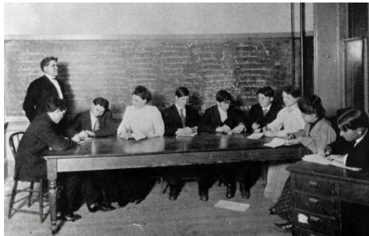
Figure 7. Classroom, 1907.

The third item in the brochure discusses the nature of the courses outlined in the catalog. None are listed for “mere display” but are each taught in such a way as to produce “scholarly university graduates.” The fourth point emphasizes the quality of work again by assuring potential students that all of their