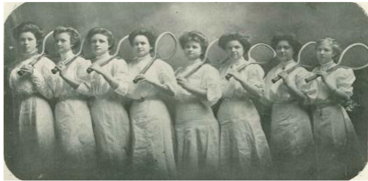
Figure 20. Girls' Tennis Club. 1903 Pictorial Bulletin.

facilities for male students because young women did not indulge in the outdoor sports and activities, such as football and baseball, the men did. 25 The