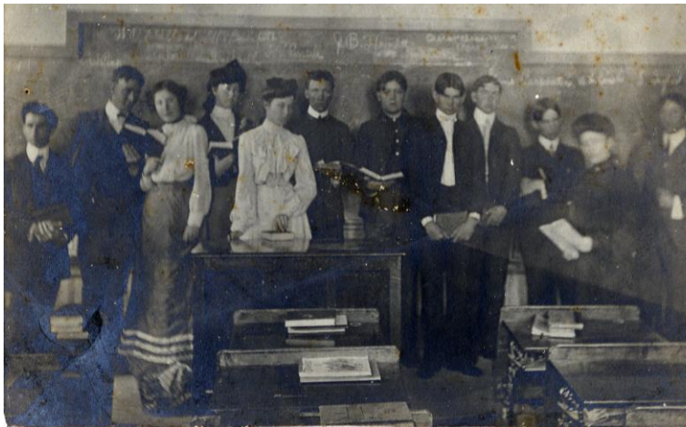
Figure 5. Latin Class, 1903. TCU Special Collections, 2420.

Another crucial point in this list is that all students, men and women, do the same coursework. As had been the case since the first term, there was a single curriculum at Add-