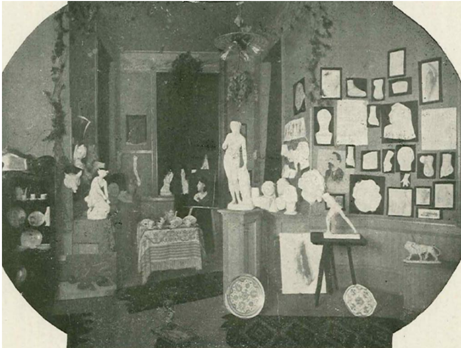
Figure 14. Gallery in Art Studio. 1903 Pictorial Bulletin.