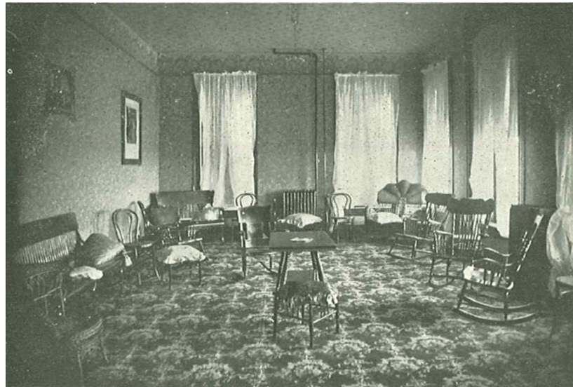
Figure 9. Girls' Home Parlor. 1903 Pictorial Bulletin.

Texas for the first time, finally meeting the nationwide proportion. 13 Add-Ran Christian University seemed to provide all of the