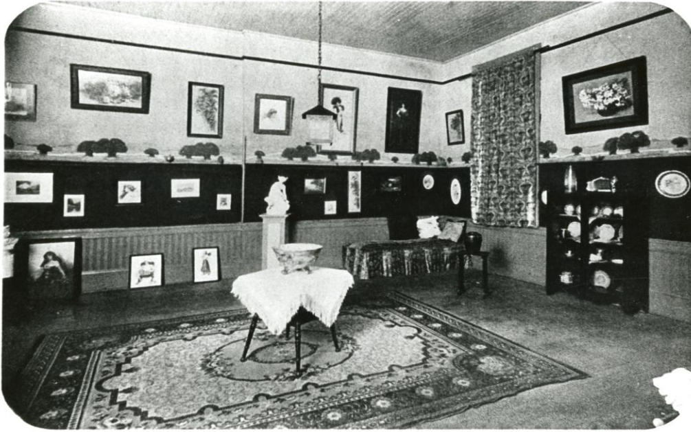
Figure 13. Art Studio. TCU Special Collections, 1907.