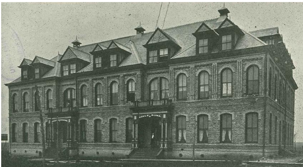
Figure 19. Girls' Home after renovations. 1903 Pictorial Bulletin.

In 1902, the year after this brochure was printed, as part of a campus-wide expansion and improvement, the Girls' Home was enlarged to house up to one hundred students at the cost of $4,500; it was also connected to the newly constructed heating plant to provide better, more efficient heat 21 (see fig. 19). That same year, the president of the university stated in his report to the trustees that the Girls' Home would need to be further enlarged in the future to accommodate more female students; he also requested additional bathing facilities and water closets for the both the girls' and boys' dormitories. 22 By the next year, the Girls' Home almost reached capacity with ninety-seven girls making up more than 43 percent of the