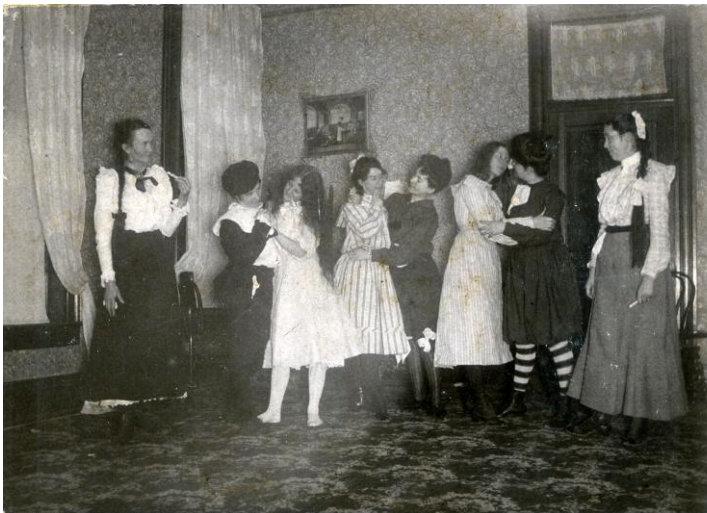
Figure 16. “Tacky Party” at Girls’ Home. TCU Special Collections, 1390.

activities involving these women. One portrays an all-female Shakespeare burlesque production showing the women putting their literary education to use (see fig. 15). Another depicts the women living in the dormitory having a “tacky party,” in which the guests intentionally wore mismatching clothing and generally tried to appear “tacky” (see fig. 16).