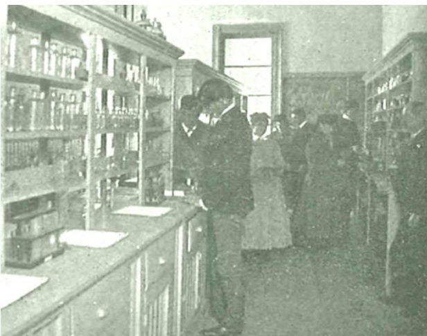
Figure 8. Chemistry Lab. 1903 Pictorial Bulletin.

completed coursework would be accepted at other prominent institutions in Texas and out of state. This point also mentions again that the Texas State Board of Education counts Add-