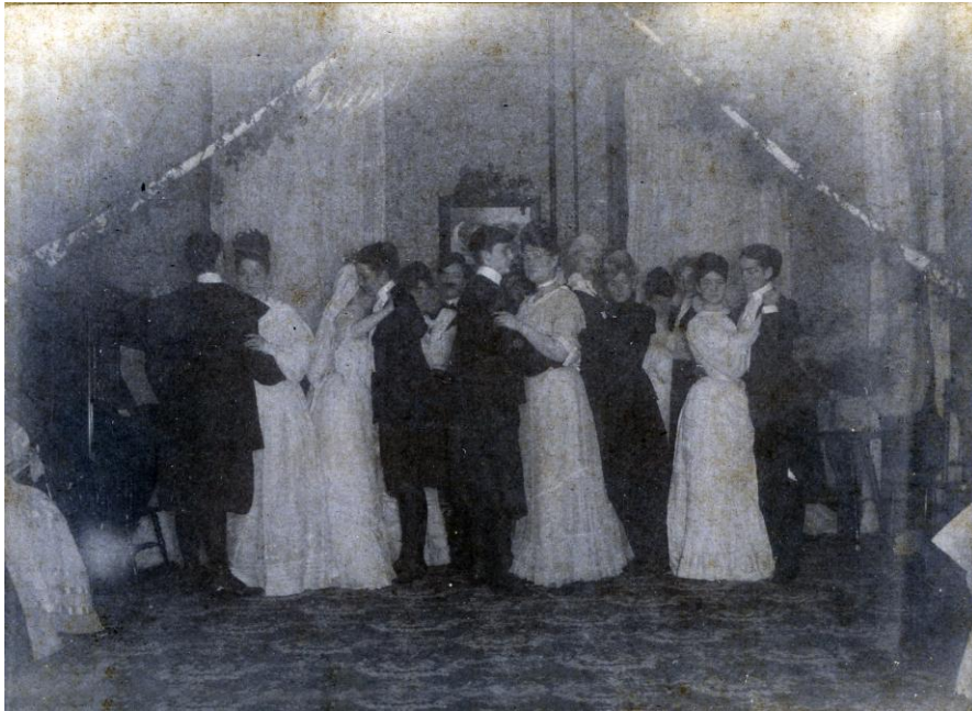
Figure 18. Ball after "Manless Wedding."