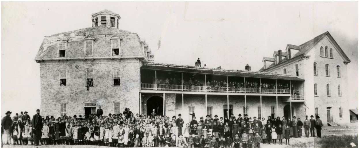
Figure 1. Add-Ran College faculty and student body, Thorp Spring.

By the printing of the fourth catalog for the 1876-1877 session, there was no longer a “Male-Female Curriculum.” Instead the classes were listed as “Course of Study of Add-Ran College.” Like the earlier areas needing male-female distinctions, the curriculum was now firmly established for all students of both sexes and no longer needed clarification. 24 A photograph taken in 1878 depicts further evidence of the equality of men and women at the school. The picture shows all of the men and women of the faculty and student body of Add-Ran College grouped together in front of the main building with no divisions between the