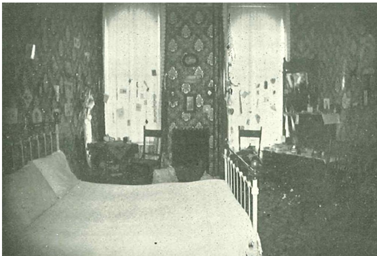
Figure 11. Student’s room in Girls’ Home, 1903 Pictorial Bulletin.

The university also promoted outings and physical activities that were led by “skillful teachers,” at no added charge. This inclusion of physical activity demonstrates both the