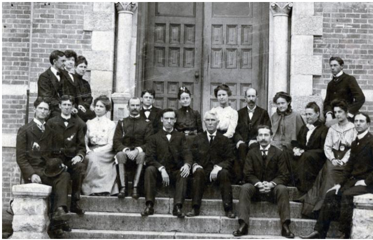
Figure 21. 1901-02 TCU Faculty.

Like the female students, women in the faculty of the university also continued to garner respect into the twentieth century. As in Thorp Spring, photographs of the faculty feature the men and women together and show that women continued to make up