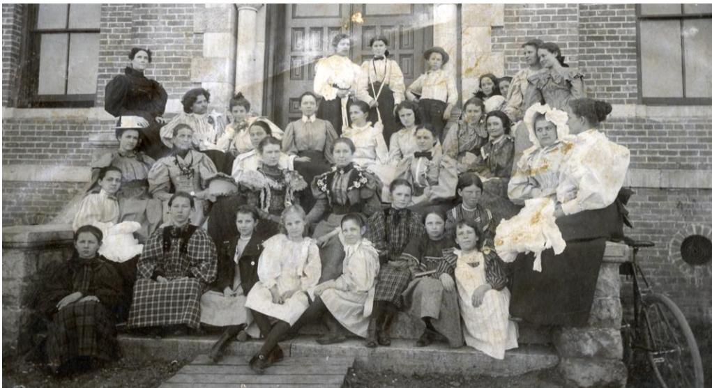
Figure 2. Women students on steps of Main Building, 1897.

country. School officials feared the ramifications of these statistics and began to question women's commitment to being serious students. These women were no longer the first generation to attend colleges and universities—the one who had proven themselves dedicated to academics by excelling in their studies and completing their degrees—and they were accused of using higher education as a social opportunity or merely a way to find a potential husband. 3 Some coeducational schools began to restructure their campuses and curricula to keep the sexes separated and to revert women's education back to basic and domestic subjects more appropriate for their place in society. 4 A way that women combated the social anxieties of the early twentieth century was to modify their appearance to resemble popular culture image of the Gibson Girl. Made popular in the drawing and short stories of the Progressive Era, Gibson Girls were the new “American girl” with upswept hair, high-collared