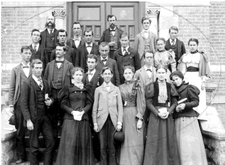
Figure 22. TCU Faculty ca. 1902.

considerable parts of the teaching staff when in 1901 they represented 27 percent and the next year, 42 percent of the total faculty (see figures 21 and 22).