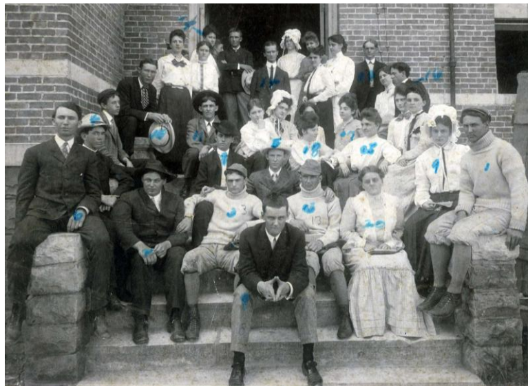
Figure 4. Spanish class on the Main Building Steps, 1904-05.

a wise course of action and “directly in the path of human evolution.” Even at the turn of the century, coeducation was still a widely debated topic, but, this brochure demonstrates the continued commitment of Add-Ran to educating