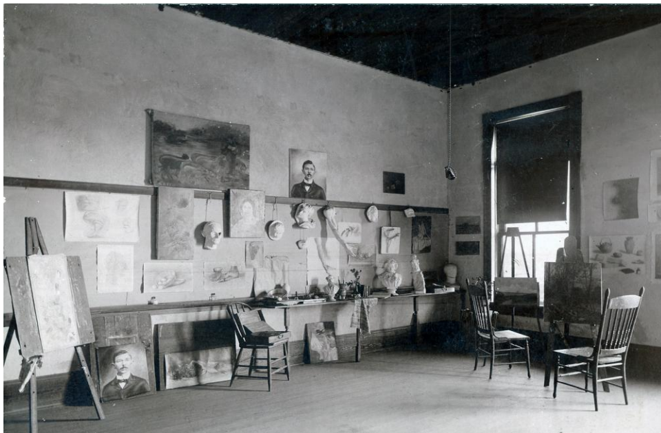
Figure 12. Art Studio. TCU Special Collections, 482.

learned to work with a variety of subjects, from people and animals to landscapes and still-life objects (see figures 12, 13, and 14). The art studio provided functional space for drawing, painting, sculpting, and creating ceramics with tables, easels, and ample light as well as decorative space for the display of the students' creations. Often at commencement ceremonies, the students of the music and oratory departments, women included, would perform what they had been learning. They performed vocally and with instruments the various works of classic famous composers like Beethoven as well as more contemporaneous artists such as Guido Papini showing great variety in their lessons. 17 In art as well as music and oratory, the female students were able to display what they had learned in prominent ways, and the university seemed proud of their accomplishments.