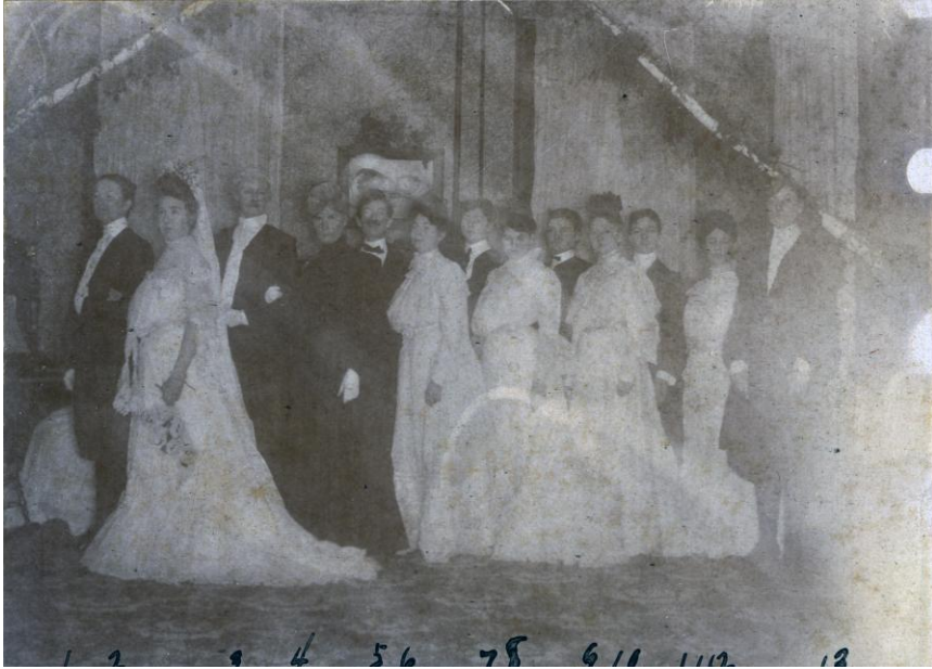
1 2 3 4 5 6 7 8 9 10 11 12 Figure 17. "Manless Wedding," 1904.