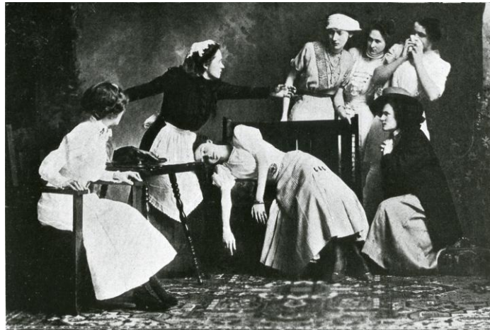
Figure 15. Shakespearean Burlesque Scene. TCU Special Collections, 580.

wholesome. 18 Outside of their classes, the young women of Add-Ran seem to have had opportunities to enjoy their time at the school. There is photographic evidence for various kinds of recreational