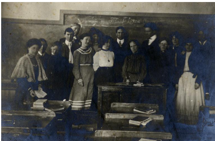
Figure 6. Latin Class, 1903.

Ran so that the degrees earned by young women were equal to those earned by their male classmates, which, as the brochure mentions, is more than most strictly women's colleges or universities of this era could claim. 9 Again, photographs of classes in this era prove that men and women worked side by side, doing the same coursework under the same teachers. The students of both sexes shared classrooms, and